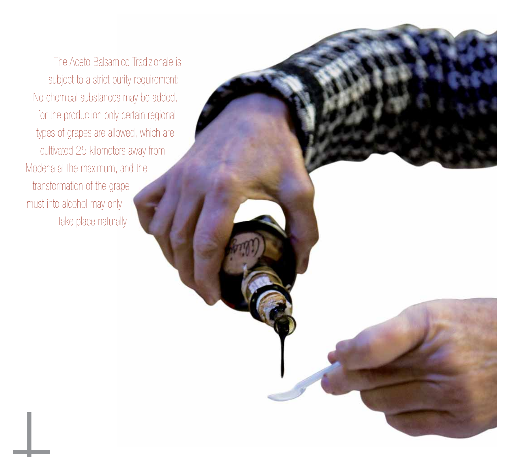
The Aceto Balsamico Tradizionale is more than just vinegar. To enjoy its pure exquisite taste is always a special experience for the young and the young at heart.