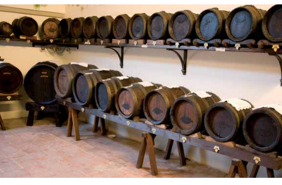
In these batteries of exotic wood barrels the "brown gold" of the Acetaia di Giorgio ages.

The whole procedure of the production and filling of Aceto Balsamico